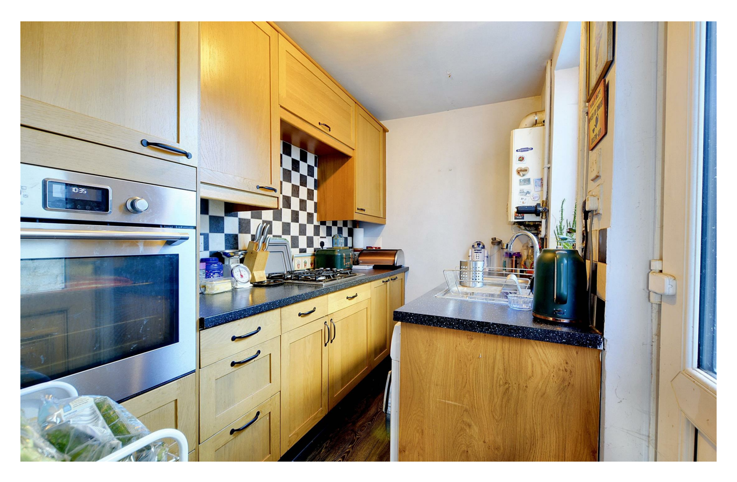
THIS IS A LOVELY TWO DOUBLE BEDROOM MID PROPERTY WHICH HAS OPEN PLAN LIVING SPACE TO THE GROUND FLOOR.

Being situated on Granville Avenue, which is close to the centre of Long Eaton, this mid property offers a lovely home which will suit a whole range of buyers who are looking to purchase a home in Long Eaton for either their own occupation or to rent out. Since being originally constructed the property has been altered internally so the two ground floor rooms have been combined to provide an open plan living space with the lounge at the front and dining area at the rear. For the size and layout of the accommodation to be appreciated, we do recommend that interested parties do take an internal inspection which will also enable them to see the length of the landscaped, private garden at the rear which provides several seating areas to sit and enjoy outside living.