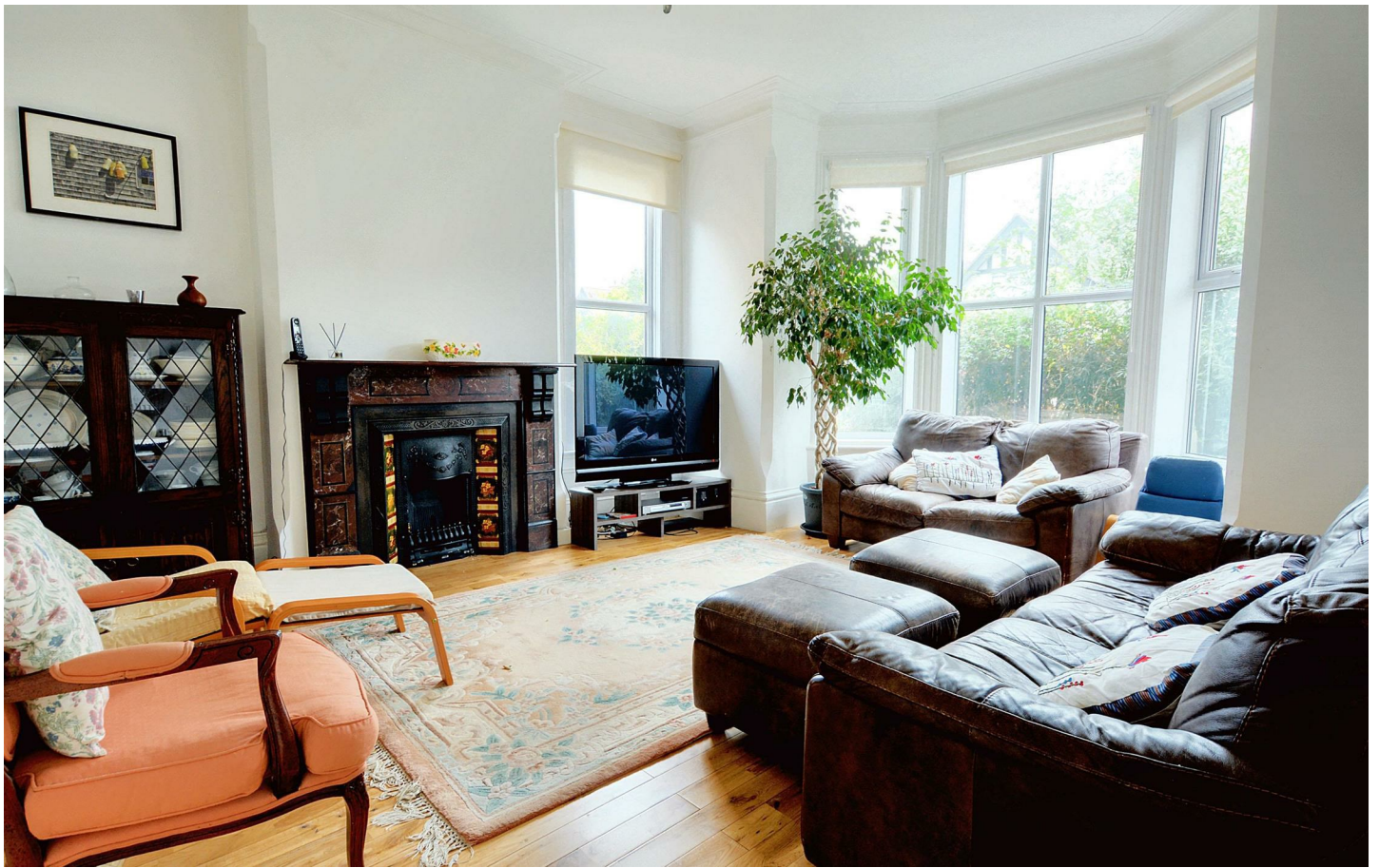
A substantial Victorian five/six bedroom semi-detached house.

Washington Villas is a fine example of Victorian style and charm, retaining much of its original character with high ceilings and generous room sizes, this elegant house has been well maintained yet offers further potential.