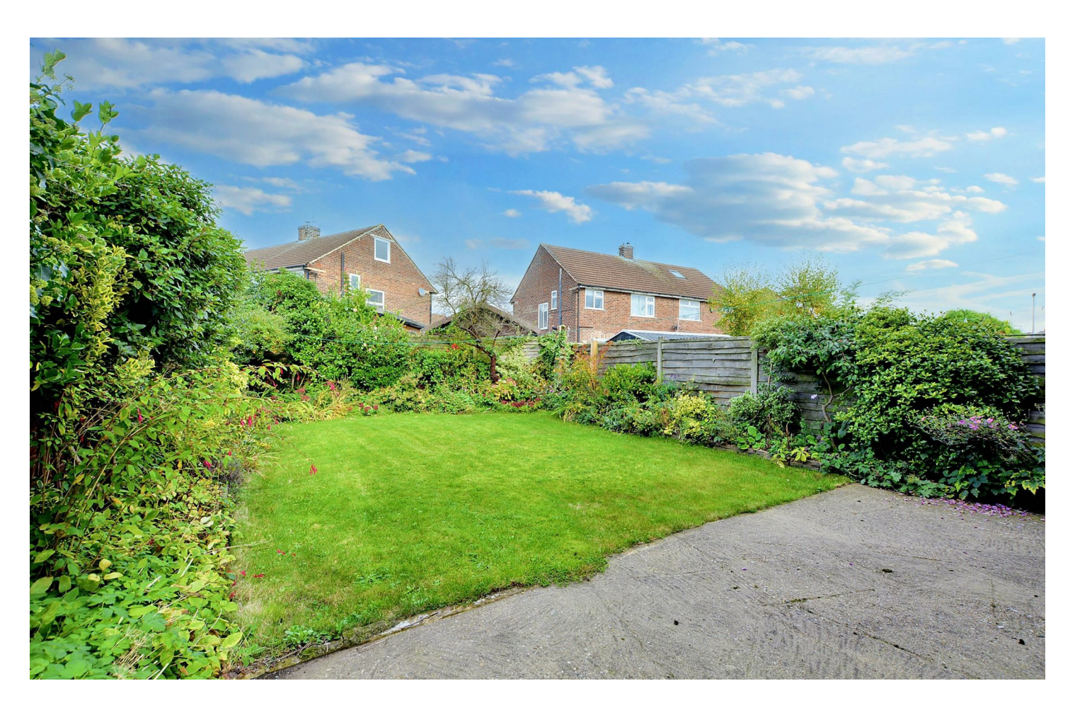
A SPACIOUS THREE BEDROOM SEMI-DETACHED HOUSE WITH OFF STREET PARKING, GARAGE AND ENCLOSED REAR GARDEN BEING SOLD WITH THE ADDED BENEFIT OF NO ONWARD CHAIN.

Robert Ellis are pleased to be instructed to market this well presented, three bedroom semi-detached house that is being sold with the added benefit of no onward chain. The property is constructed of brick to the external elevations and has double glazing and gas central heating throughout. This would make an ideal home for a first time buyer, the growing family or perhaps people who are looking to downsize from a much bigger property and would like fantastic access to local amenities and transportation. An internal viewing is highly recommended to appreciate the property and location on offer.