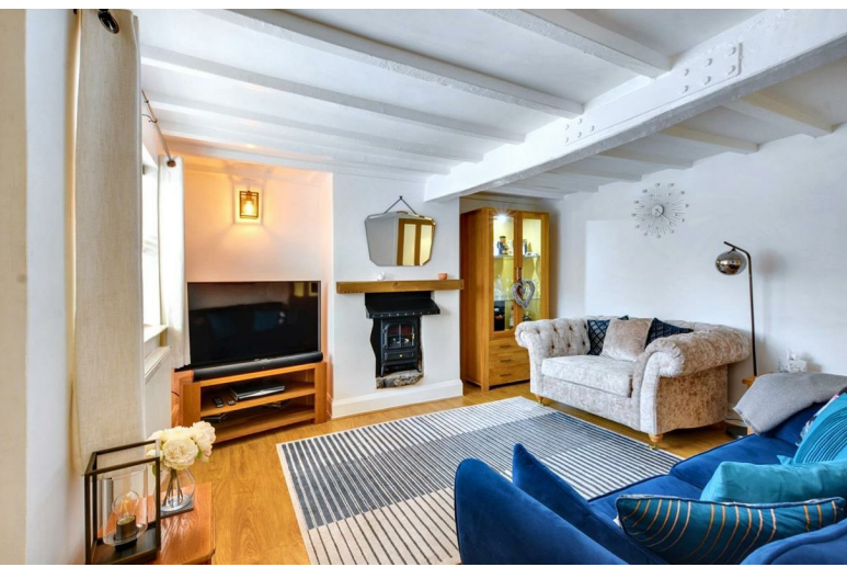
Main Street Stanton-By-Dale, Derbyshire DE7 4QH