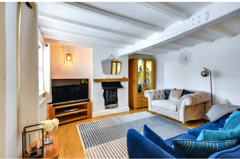
Main Street Stanton-By-Dale, Derbyshire DE7 4QH