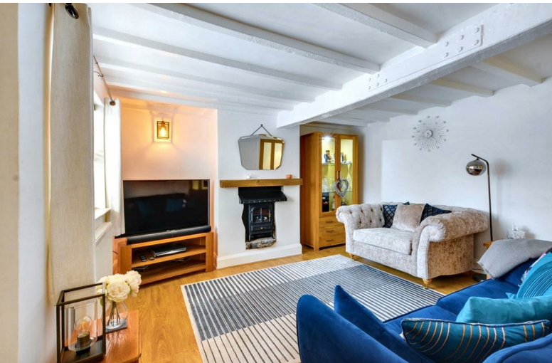
Main Street Stanton-By-Dale, Derbyshire DE7 4QH