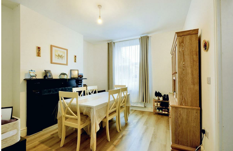
St. James Street Stapleford, Nottingham NG9 7BA