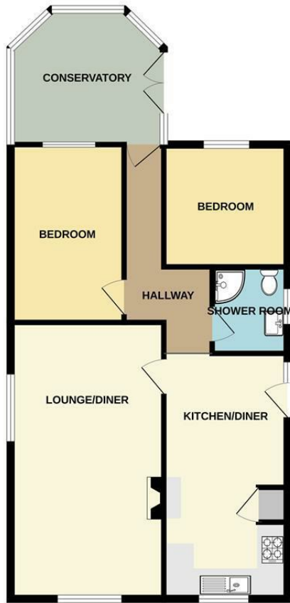
GROUND FLOOR 756 sq.ft. (70.3 sq.m.) approx.