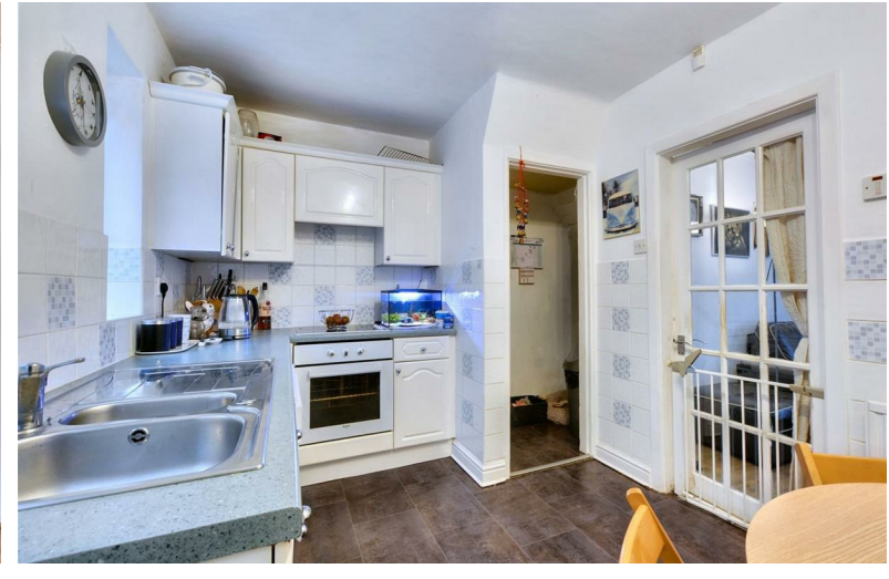
Andover Road Bestwood, Nottingham NG5 5FB