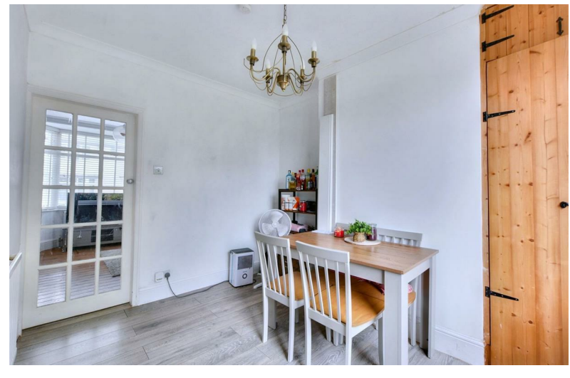
Linden Grove Stapleford, Nottingham NG9 7GQ