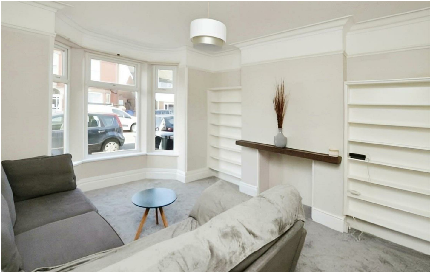
A three bedroom semi detached Victorian Villa.

This instantly attractive bay front property comes to the market with NO UPWARD CHAIN and has been modernised in recent times.