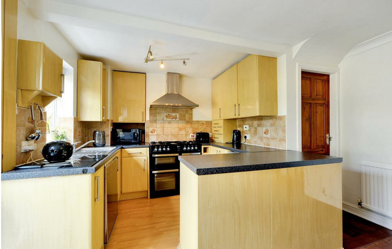
AN EXTENDED LARGE FOUR-BEDROOM SEMI-DETACHED FAMILY PROPERTY.