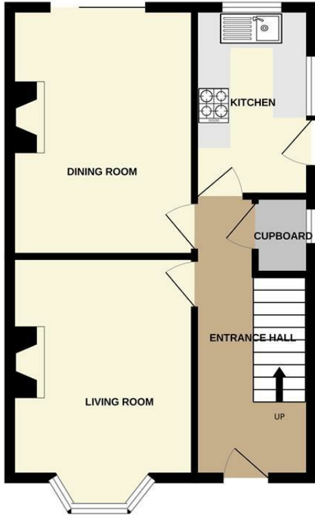
GROUND FLOOR 436 sq.ft. (40.5 sq.m.) approx.