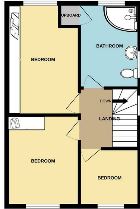
1ST FLOOR 416 sq.ft. (38.6 sq.m.) approx.