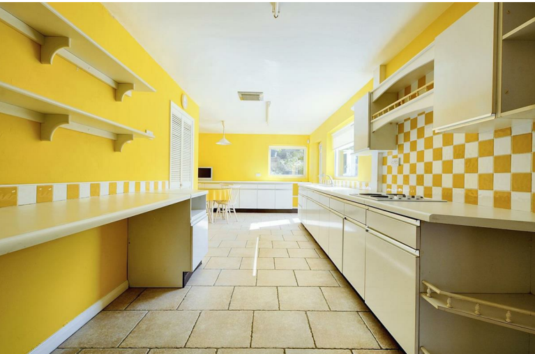
Revesby Road Woodthorpe, Nottingham NG5 4LL