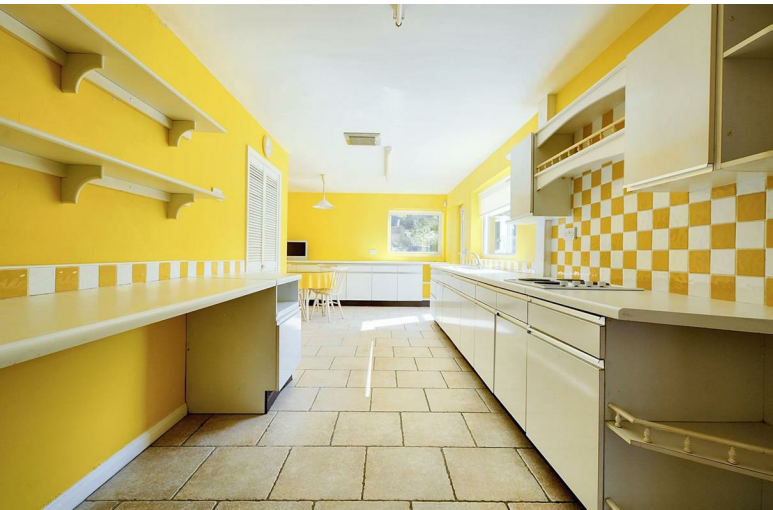
Revesby Road Woodthorpe, Nottingham NG5 4LL