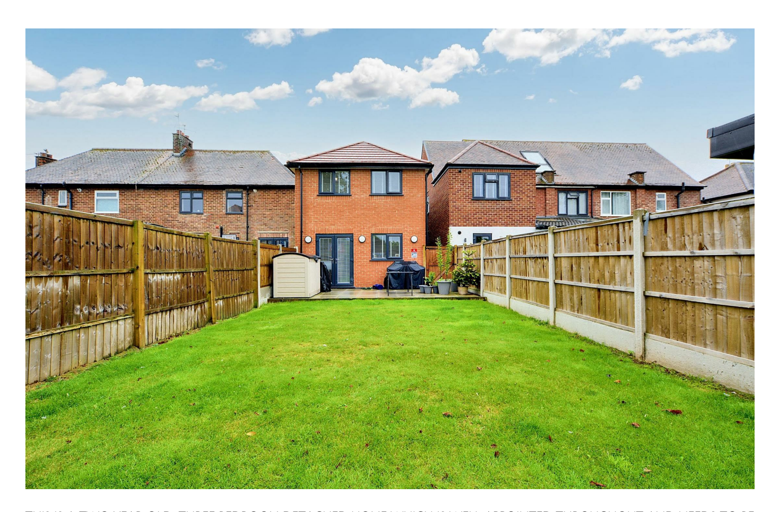
THIS IS A TWO YEAR OLD, THREE BEDROOM DETACHED HOME WHICH IS WELL APPOINTED THROUGHOUT AND NEEDS TO BE VIEWED BY INTERESTED PARTIES FOR THE SIZE OF THE ACCOMMODATION TO BE APPRECIATED.

Being located on Portland Road in the heart of Toton, this almost new three bedroom detached house offers a lovely home which will suit a whole range of buyers, from people buying their first property through to families who are looking for a three bedroom home which is close to the excellent local schools offered by Toton. For the size of the accommodation and privacy of the rear garden to be appreciated, we recommend that interested parties do take a full inspection so they are able to see all that is included in this lovely home for themselves. The property is well placed for all the local amenities and facilities and transport links, all of which have helped to make this an extremely popular and convenient place to live.