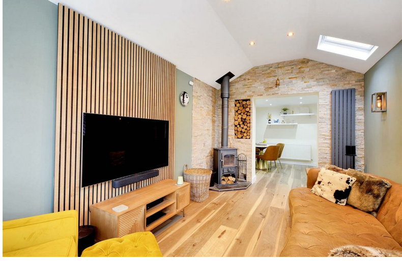
Pritchard Drive Stapleford, Nottingham NG9 7GW