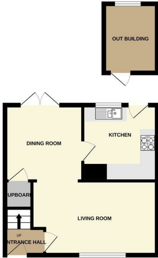
GROUND FLOOR 425 sq.ft. (39.5 sq.m.) approx.