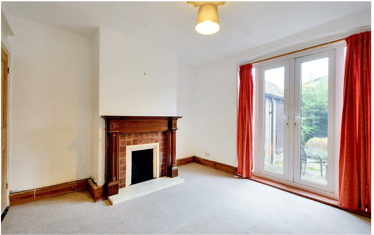
A spacious two-double bedroom mid-terrace house.

Situated in this sought-after and well established residential location, within walking distance of a variety of local shops and amenities including schools, transport links, Beeston Town Centre, The University of Nottingham, and Boots Head Office, this fantastic property is considered an ideal opportunity for a range of potential purchasers including first time buyers, young professionals, and investors.