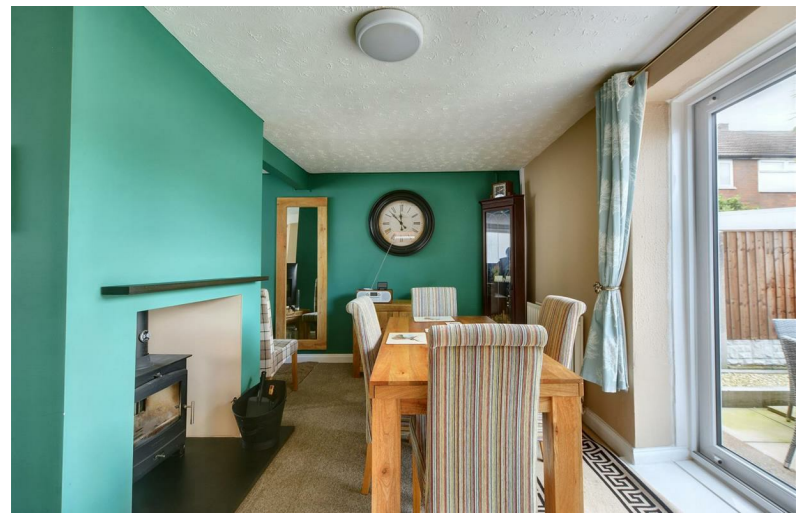
Flatts Lane Calverton, Nottingham NG14 6LA