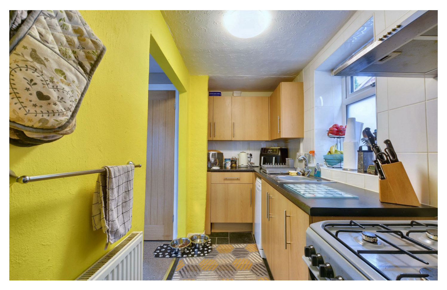
** IDEAL FAMILY HOME **

Robert Ellis Estate Agents are delighted to bring to the market this fantastic THREE BEDROOM SEMI DETACHED family home positioned within the heart of Calverton, Nottingham.