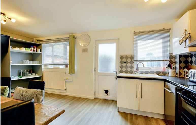
Lock Close Kirk Hallam, Derbyshire DE7 4HG