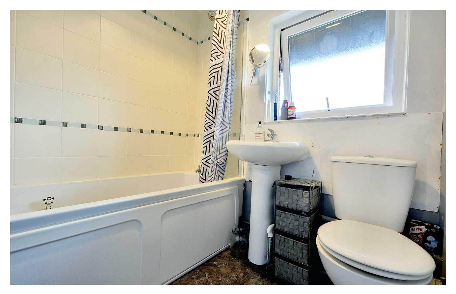
ROBERT ELLIS ARE DELIGHTED TO WELCOME TO THE MARKET THIS WELL PRESENTED AND SPACIOUS THREE BEDROOM MID TERRACED HOUSE OFFERED FOR SALE WITH NO UPWARD CHAIN.

With accommodation over two floors, the ground floor comprises entrance hall with useful ground floor WC and deep storage space, living room and full width dining kitchen. The first floor landing then provides access to three bedrooms and a bathroom suite.