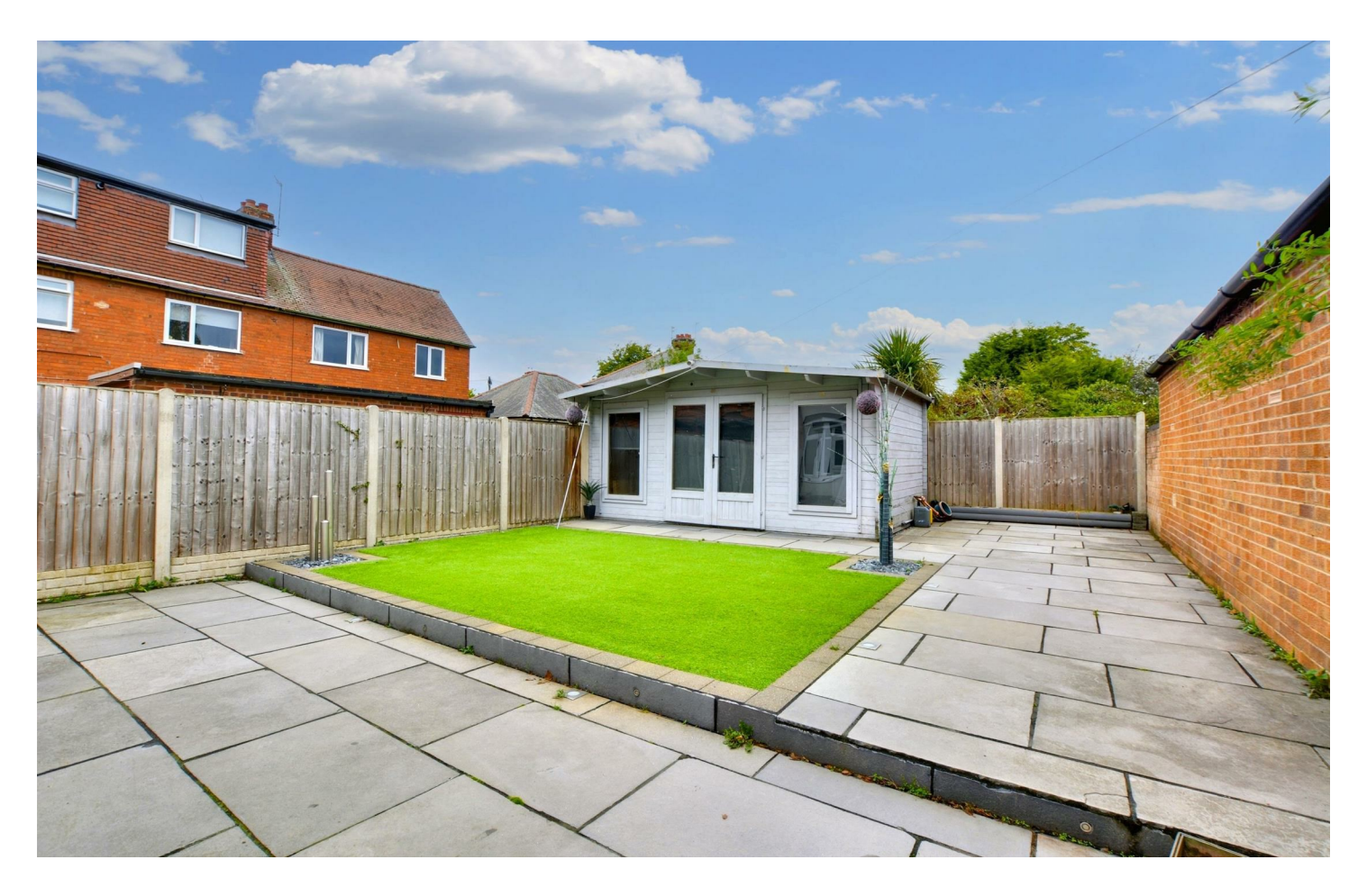
AN IMMACULATE AND FULLY RENOVATED THREE BEDROOM SEMI DETACHED PROPERTY OFFERING SPACIOUS ACCOMMODATION BEING SOLD WITH NO UPWARD CHAIN!

Robert Ellis are extremely pleased to bring to the market this much improved three bedroom semi detached property that has been elegantly finished, situated on the outskirts of Long Eaton with easy access to all the local amenities and facilities. The property provides spacious accommodation over two levels and derives the benefit of modern conveniences such as gas central heating and double glazing. The contemporary open plan dining kitchen is sure to tick many boxes with a large island and breakfast bar with French doors opening to the rear garden.