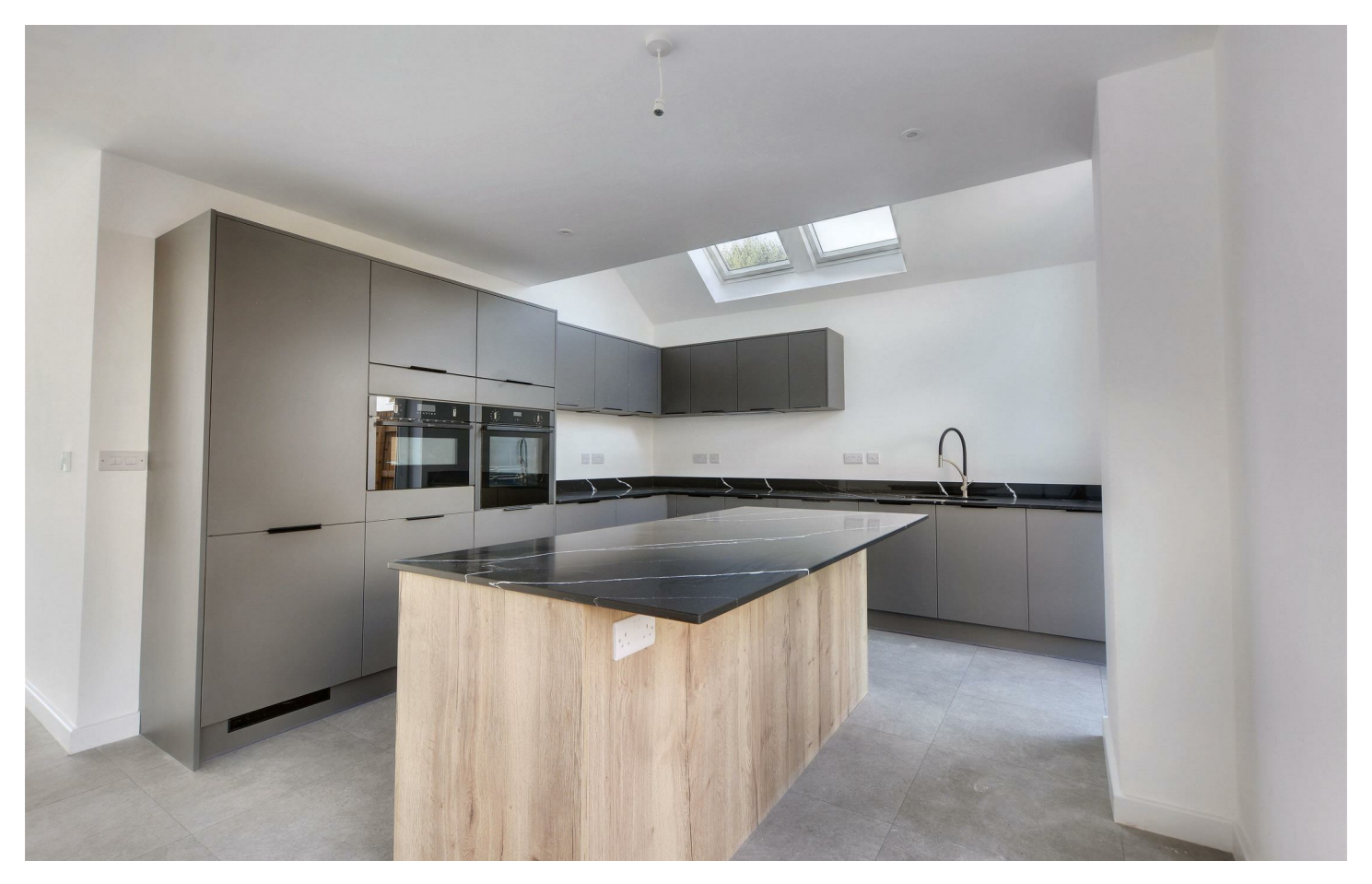
A fabulous four-bedroom, new build detached Eco house, constructed by Maltby Homes.

This quality individual property, with an appealing open plan ground floor living space has all the benefits of an A-rated Eco Home, whilst still retaining an attractive and traditional façade, behind which lies a stylish and contemporary living space.