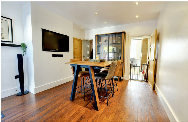
Kingsway Ilkeston, Derbyshire DE7 4DG