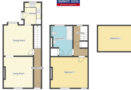
HOUSE 3 & 5