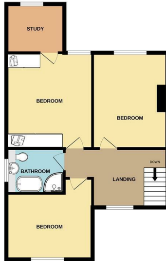
1ST FLOOR 661 sq.ft. (61.4 sq.m.) approx.