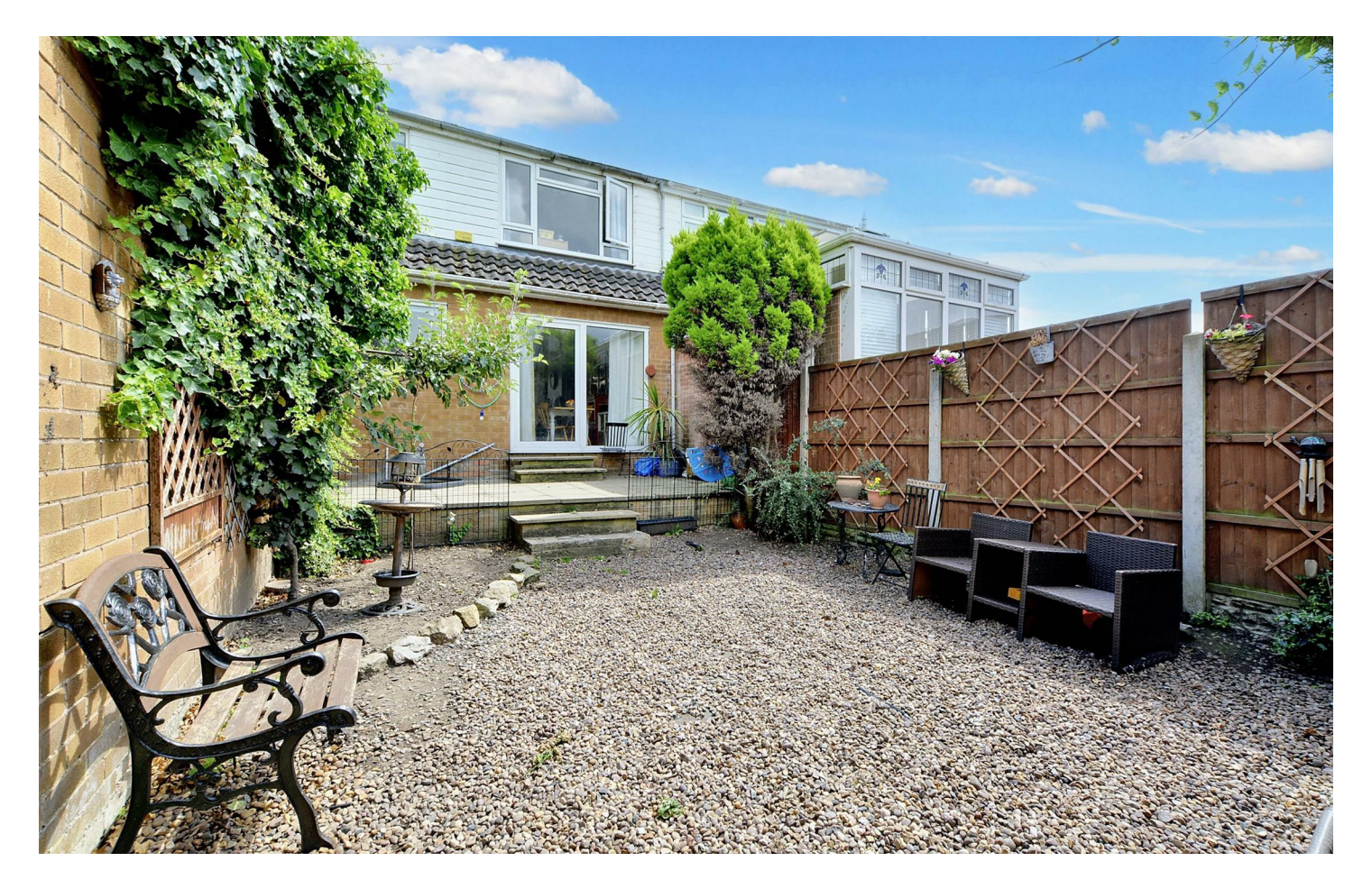
A WELL PRESENTED THREE BEDROOM SEMI DETACHED PROPERTY SITUATED IN A PRIVATE CUL-DE-SAC POSITION. AN EARLY VIEWING COMES HIGHLY RECOMMENDED IN ORDER TO SEE ALL THAT IS INCLUDED IN THIS LOVELY FAMILY HOME.

Robert Ellis are very pleased to be instructed to market this traditional three bedroom semi detached property that has been improved by the current owners and benefits from having a re-fitted kitchen along with a re-fitted family bathroom. To fully appreciate the size and quality of the accommodation on offer, an early viewing comes highly recommended. The property is set back from Tamworth Road, situated at the head of a private cul-de-sac offering additional driveway space and private position.