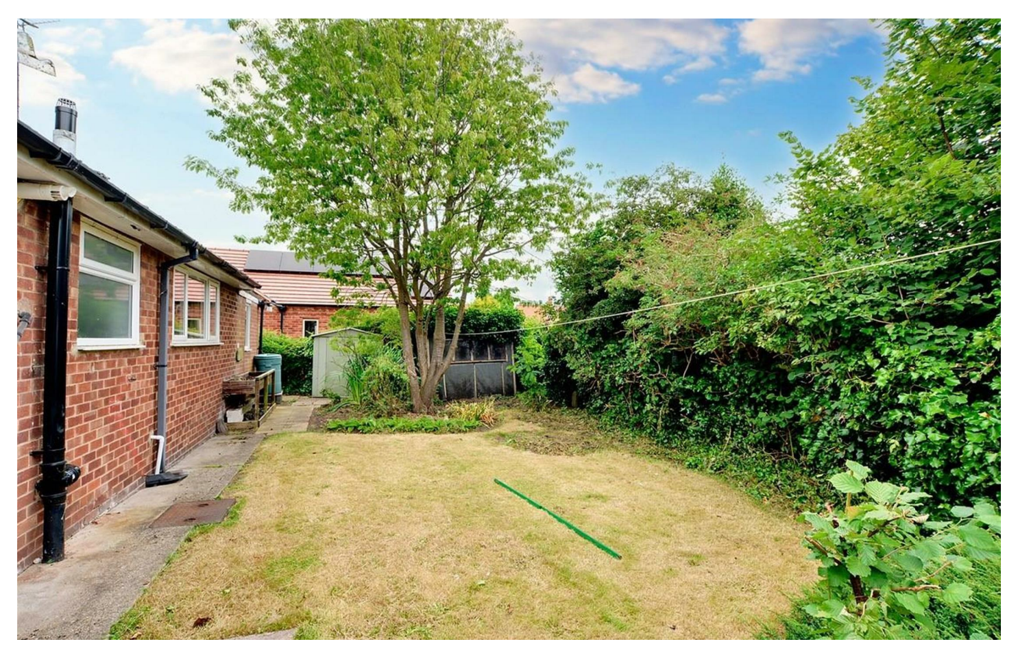
A SPACIOUS TWO DOUBLE BEDROOM DETACHED BUNGALOW LOCATED IN A POPULAR LANE IN THE HEART OF CALVERTON VILLAGE.

Robert Ellis Estate Agents are delighted to bring to the market this FANTASTIC TWO-BEDROOM, DETACHED BUNGALOW in the ever-popular village of Calverton situated on Little Lane and within proximity to well-regarded schools, ample amenities and a frequent bus route to the City Centre. Calverton is a stone's throw away from Arnold which offers a thriving high street and transportation links. Alongside this, Calverton benefits from its own array of shops and retail units. There are 4 local primary schools all under 2 miles of the property, a secondary school and a leisure centre. It is a very desirable location for any growing family or first-time buyer/Investor.