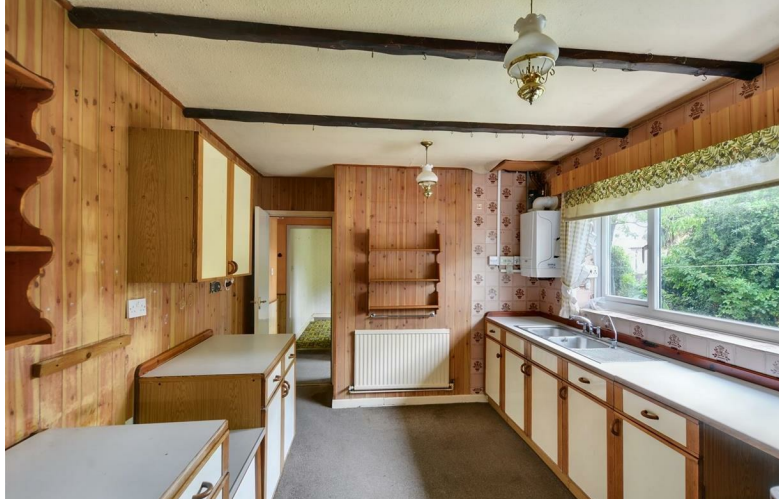
Little Lane Nottingham, Calverton NG14 6JU