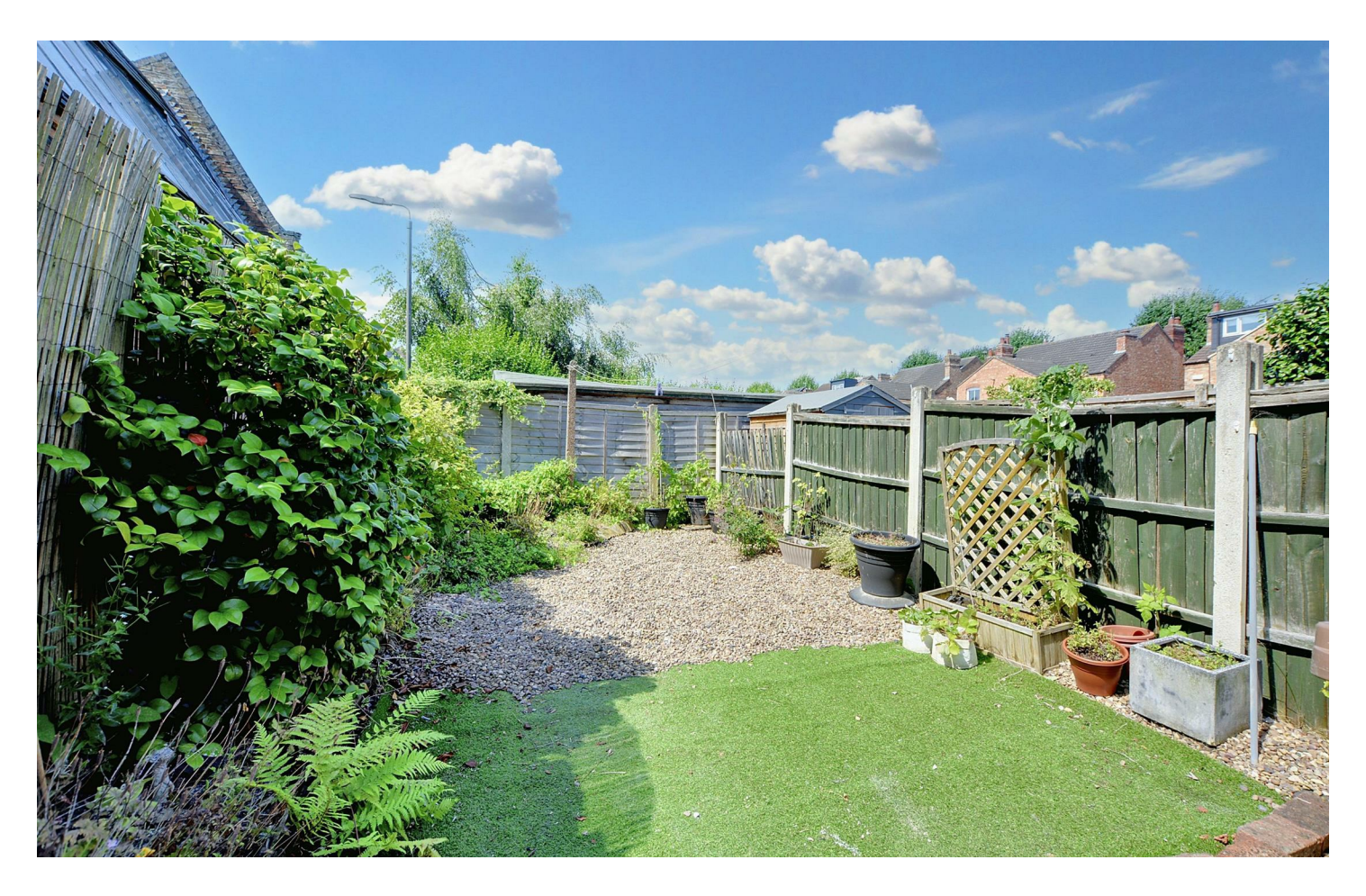
A DECEPTIVELY SPACIOUS THREE BEDROOM SEMI DETACHED HOME AVAILABLE FOR SALE WITH NO UPWARD CHAIN, VIEWING COMES HIGHLY RECOMMENDED.

Robert Ellis are delighted to bring to the market this lovely home which is situated on a popular road which is close to all the local amenities, transport links and facilities that the area has to offer. The property is also within walking distance of Long Eaton train station and we feel this particular home will suit a wide range of purchasers from first time buyers or those in search of a buy to let property with a good potential rental return in a prime letting location. The property in particular benefits from a newly fitted kitchen, utility space and brand new bathroom suite! The property comes to the market with the benefit of NO UPWARD CHAIN.