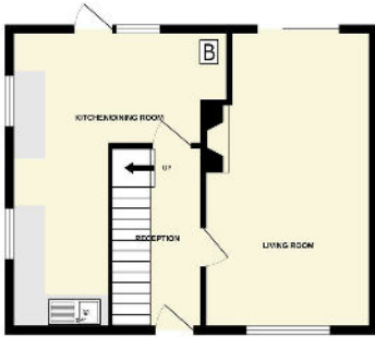
GROUND FLOOR 460 sq.ft. (42.8 sq.m.) approx.