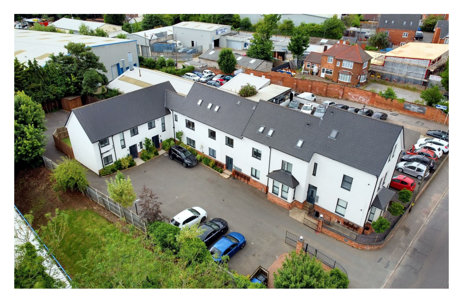
A TWO BEDROOM FIRST FLOOR DUPLEX APARTMENT, FOUND CLOSE TO LOCAL AMENITIES AND TRANSPORT LINKS.

Robert Ellis are delighted to offer to the market this modern and stylish two-bedroom first-floor duplex apartment, built in 2021. The main level features an open-plan lounge kitchen with windows to the front and rear of the property offering a bright and contemporary living space perfect for entertaining. Also on this floor, you'll find a spacious bedroom and a well-appointed three piece bathroom. Ascending the stairs, you are greeted by a small landing with cupboards before entering the master bedroom, which boasts an en suite bathroom and a luxurious walk-in wardrobe, providing ample storage and a touch of elegance. Additional features include allocated parking, secure gated access, and a telecom service for added security and convenience. This property perfectly combines modern living with comfort and peace of mind. Don't miss the opportunity to make this exceptional apartment your new home. The property is in an idyllic spot for anyone looking to commute via the M1 or A52 to Nottingham or Derby.