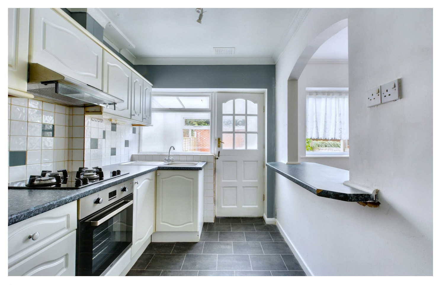
A lovely three-bedroom, mid-terrace house with the benefit of no upward chain.

Situated just a short walk to the high street, you are positioned with a wealth of local amenities on your doorstep including shops, public houses, healthcare facilities, restaurants, and transport links. This wonderful property would be considered an ideal opportunity for a large variety of buyers including first time purchasers, young professionals or anyone looking to add to a buy to let portfolio.