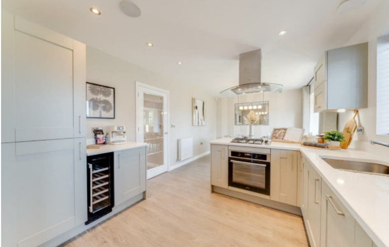
Shipley Lakeside Shipley, Heanor DE75 7JL