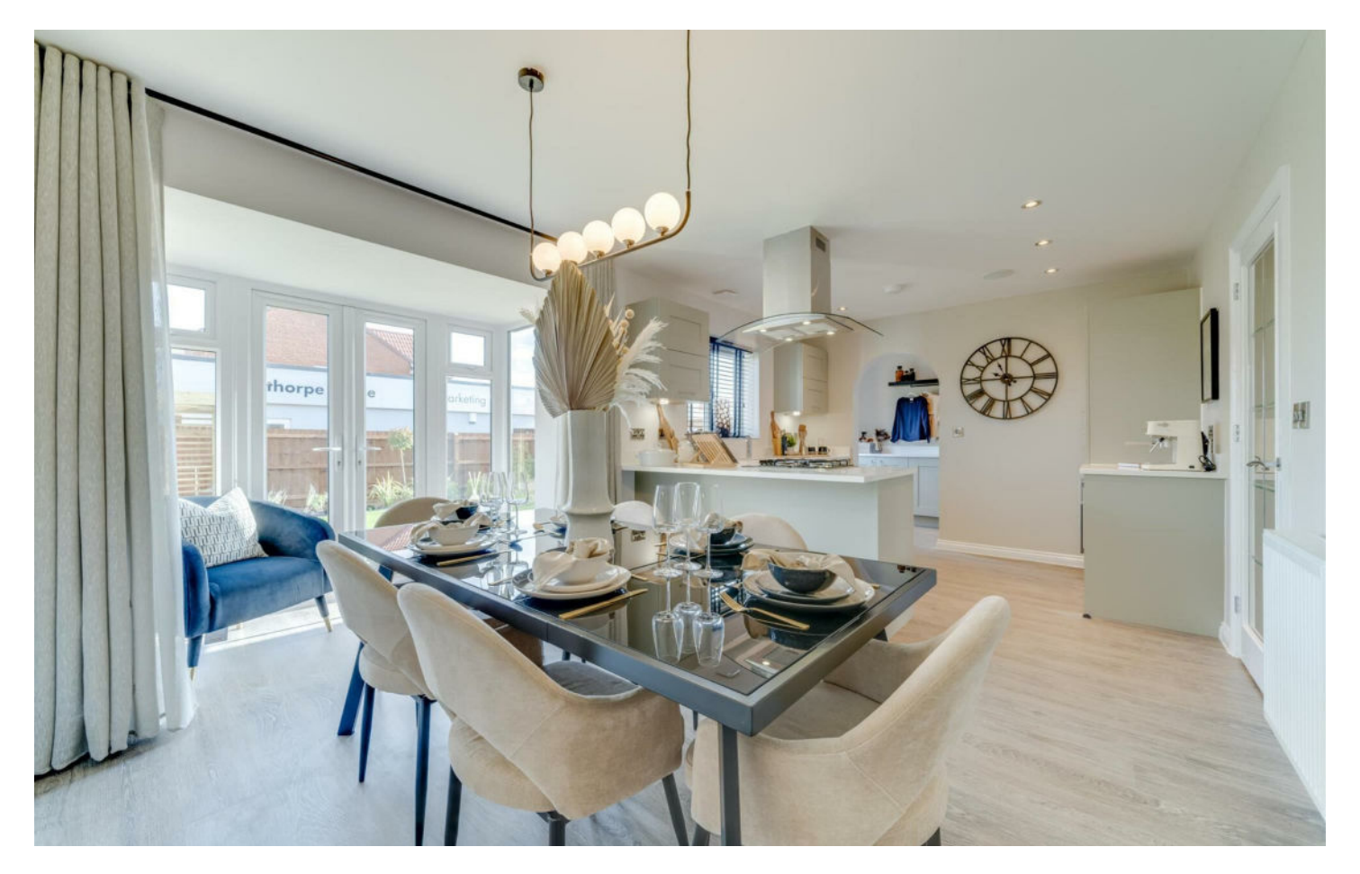
Move in this Autumn and enjoy a 5% Deposit Boost worth £20,000 when you move into the Windsor at Shipley Lakeside!

The stylish Windsor, a four bedroom detached home with integral garage offers the best in modern day living for families that want luxury and style.