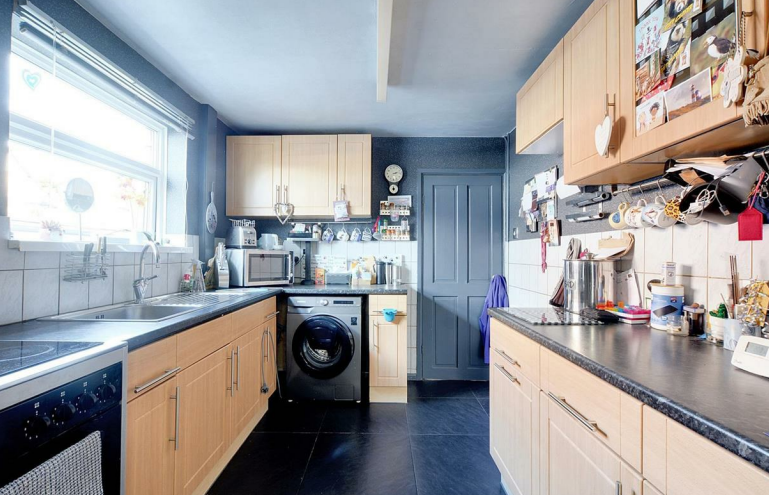
Laneham Avenue Arnold, Nottingham NG5 7LB