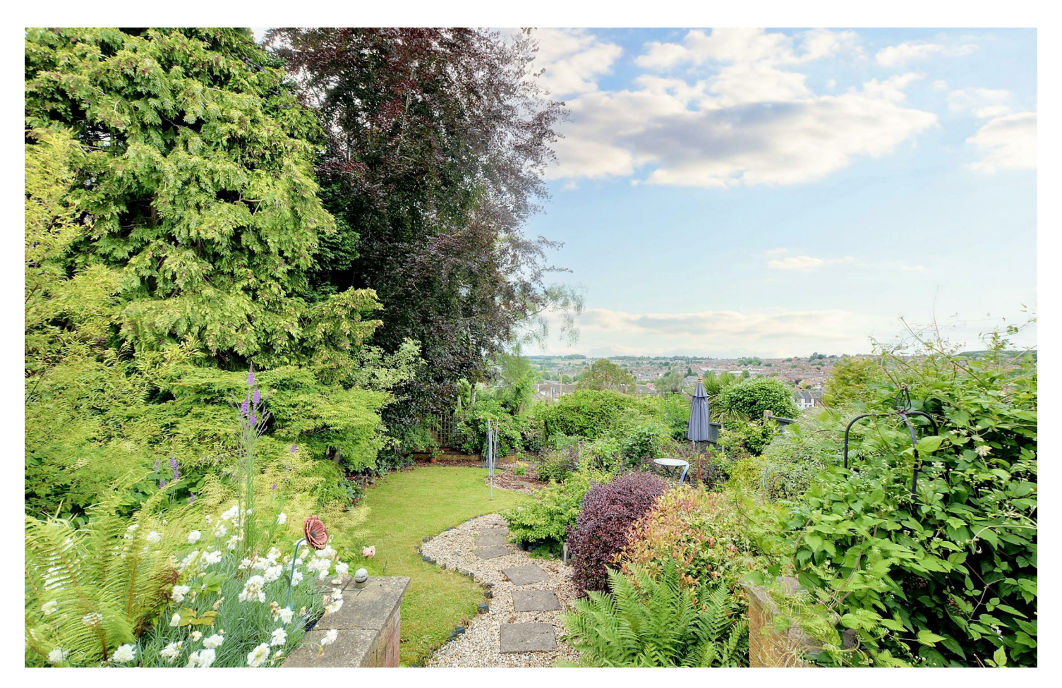
** GUIDE PRICE £260,000 - £270,000 ** IDEAL FAMILY HOME **

Robert Ellis Estate Agents are delighted to present to the market this FANTASTIC THREE BEDROOM, DETACHED FAMILY HOME situated in the HEART of ARNOLD, NOTTINGHAM.