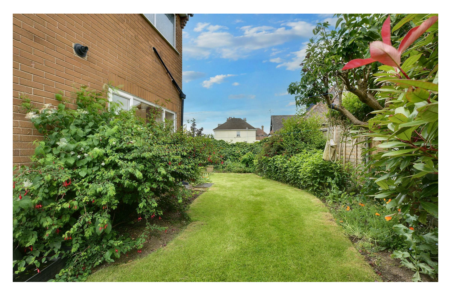
A WELL PRESENTED AND SPACIOUS, THREE BEDROOM DETACHED PROPERTY OFFERING MASSIVE POTENTIAL WITH OFF STREET PARKING AND A GARAGE, BEING SOLD WITH THE BENEFIT OF NO ONWARD CHAIN.

Robert Ellis are delighted to bring to the market this superb example of a three bedroom detached family house. The property is constructed of brick and benefits double glazing and gas central heating throughout and sits on a corner plot. The property offers stunning gardens to the front of the property with off street parking and access into the brick built garage. This home would ideally suit a wide range of buyers including first time buyers, someone looking to put their own stamp on a house and families alike. An internal viewing is highly recommended to appreciate the property and location on offer.