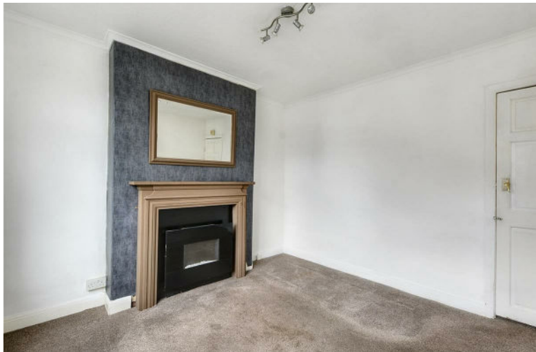
Thorpe Close Stapleford, Nottingham NG9 8FB