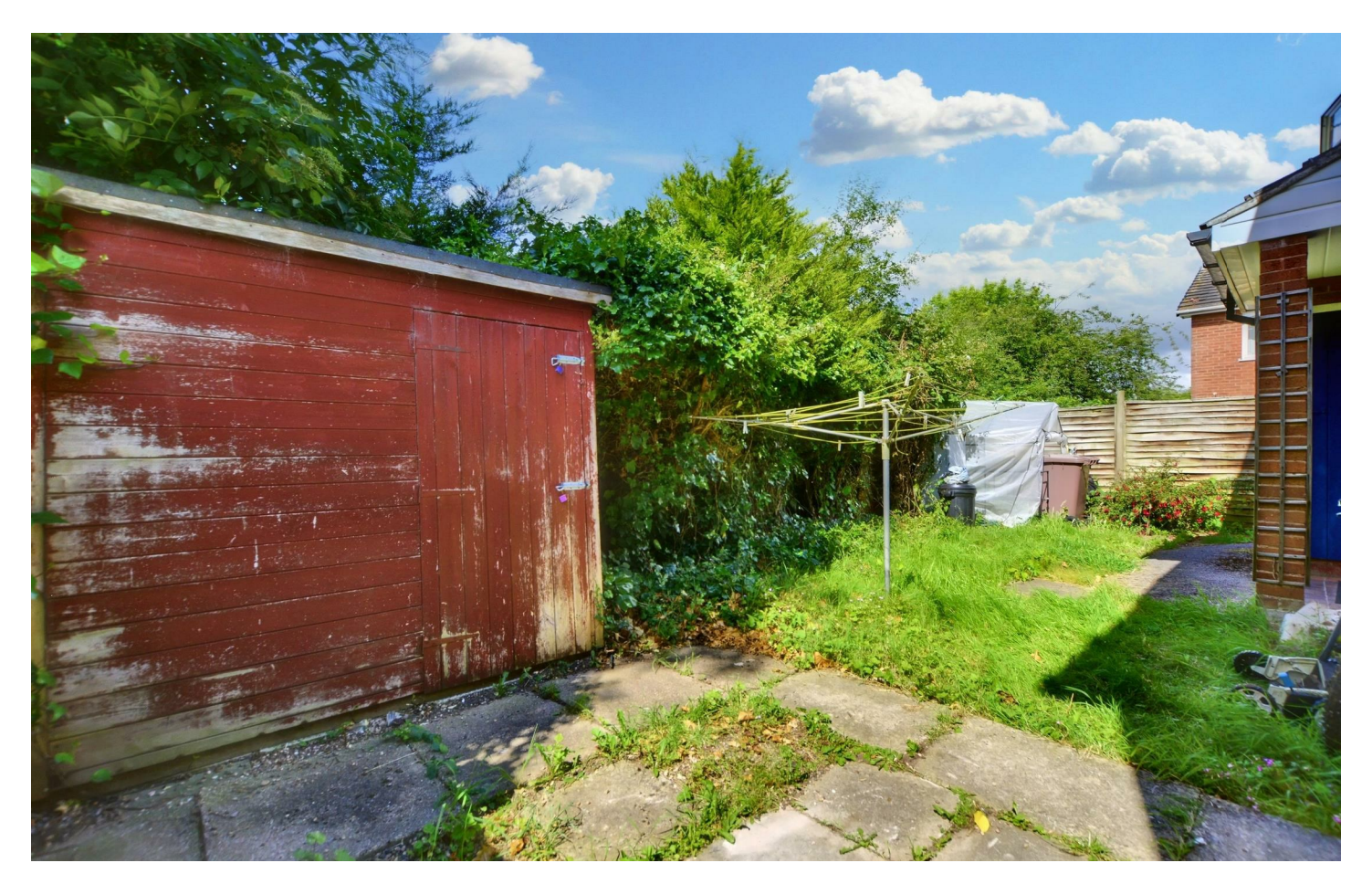
A SUPERB FULLY REFURBISHED ONE BEDROOM GROUND FLOOR FLAT WITH DRIVEWAY FOR TWO VEHICLES AND REAR GARDEN, IN A QUIET CUL-DE-SAC, CLOSE TO LOCAL AMENITIES

Robert Ellis are delighted to bring to the market this deceptively spacious leasehold and fully refurbished one bedroom ground floor flat, situated within a quiet cul-se-sac popular residential location in Long Eaton. The property benefits from a newly fitted modern kitchen diner and new shower room, along with all new flooring and has been fully re-decorated making it a perfect blank canvas. With great access and commute links to the train station, the M1 and A52 road networks as well as within walking distance of Long Eaton town centre. We believe the property will appeal to first time buyers or investors and an early bird viewing comes highly recommended.