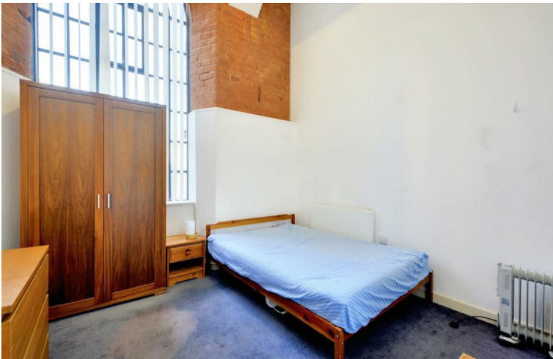
Springfield Mill Sandiacre, Nottingham NG10 5QX