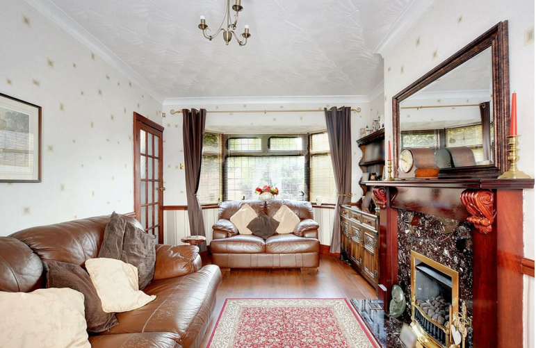
Queens Avenue Ilkeston, Derbyshire DE7 4DS