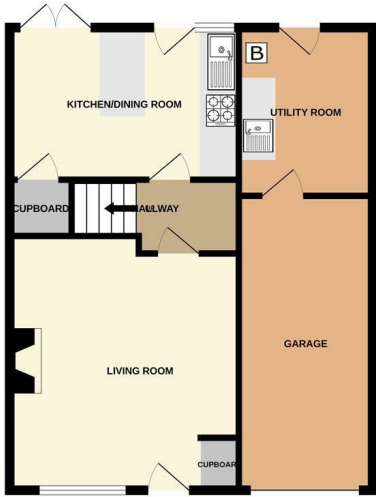
GROUND FLOOR 622 sq.ft. (57.8 sq.m.) approx.