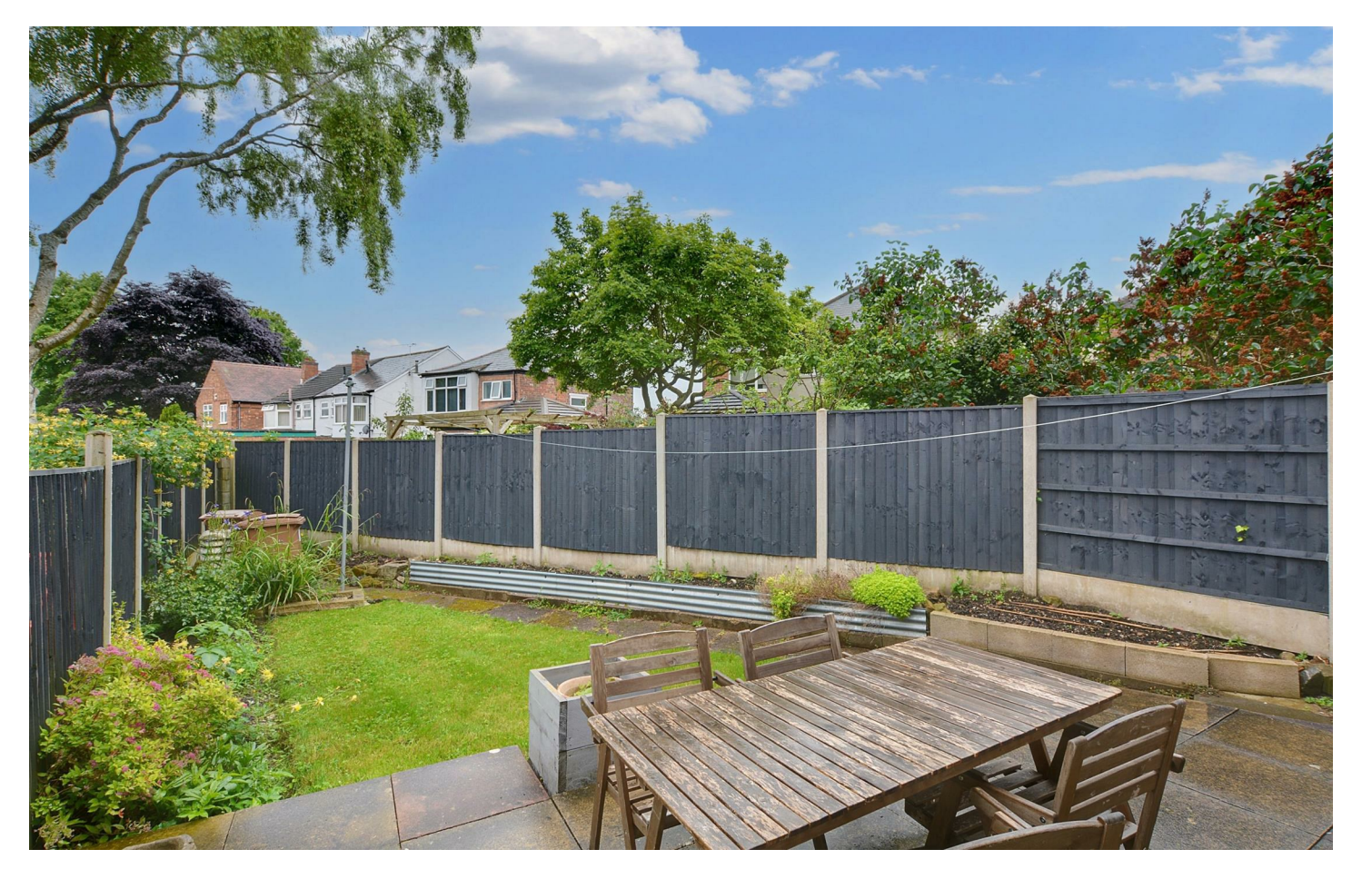
*** GUIDE PRICE £210,000 - £220,000***

ROBERT ELLIS ESTATE AGENTS ARE DELIGHTED TO OFFER TO THE MARKET THIS THREE BEDROOM END TERRACE HOME SITUATED IN BAKERSFIELD, NOTTINGHAM!