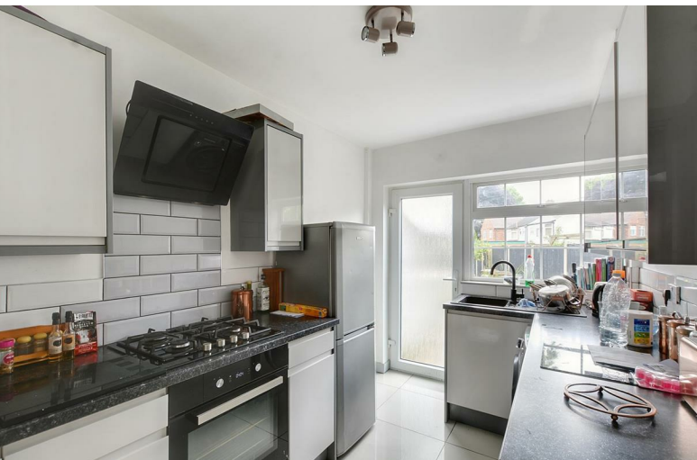
Brooklands Road Bakersfield, Nottingham NG3 7AL