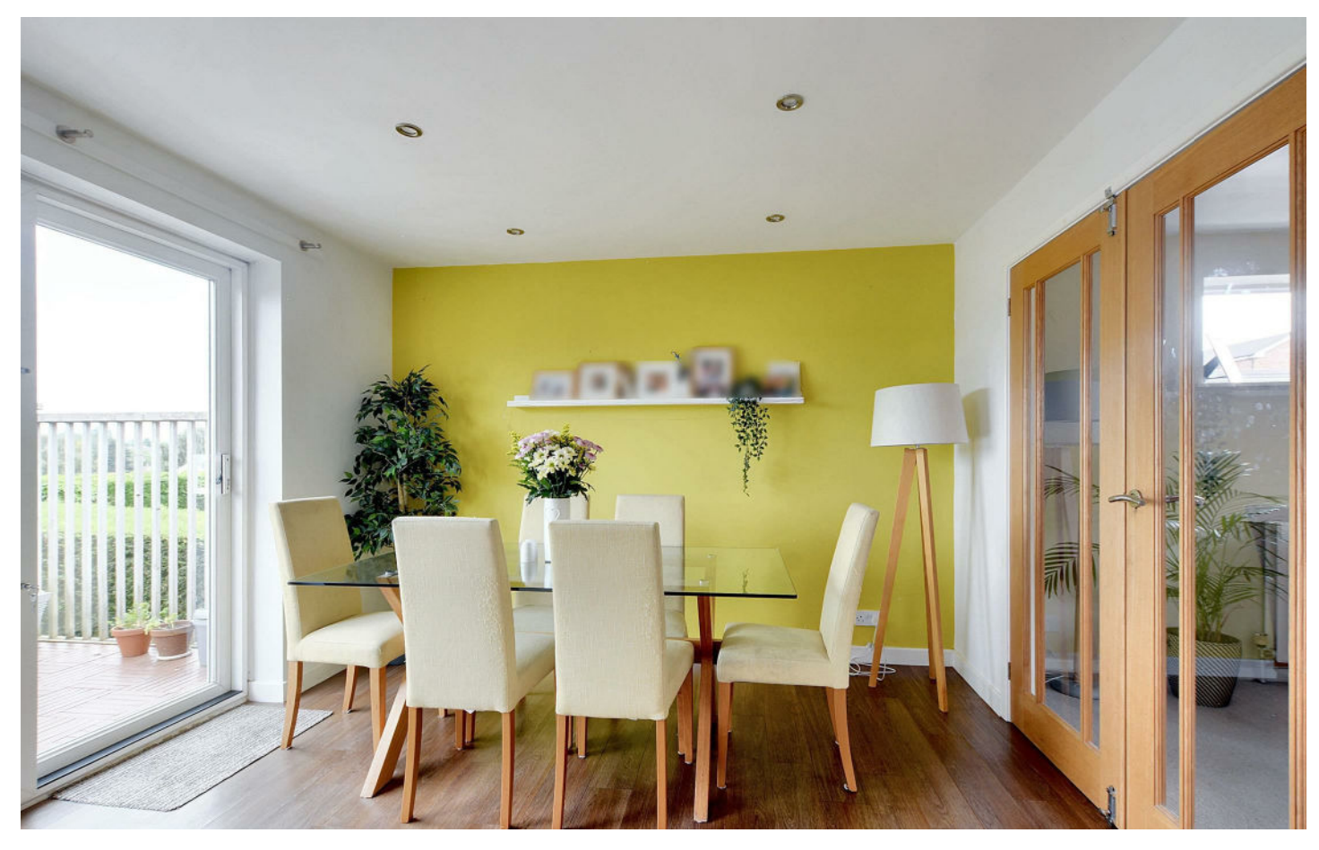
An immaculately presented and spacious three/four bedroom split level detached house.

Situated in this sought-after and well established residential location, readily accessible for a range of local shops and amenities including schools, transport links, Queens Medical Centre, The University of Nottingham and the A52 and M1 for journeys further afield, this fantastic property is considered an ideal opportunity for a variety of potential purchasers including growing families.