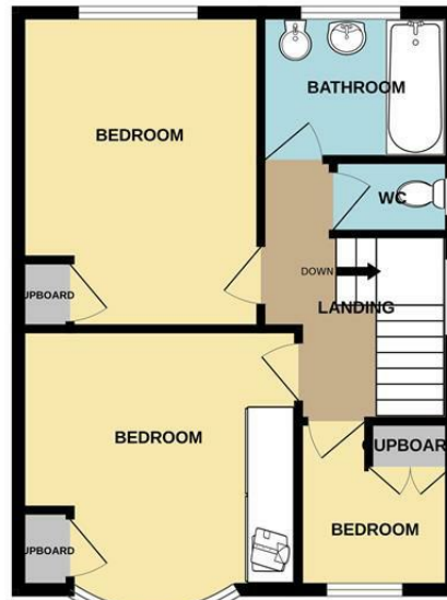
1ST FLOOR 483 sq.ft. (44.9 sq.m.) approx.