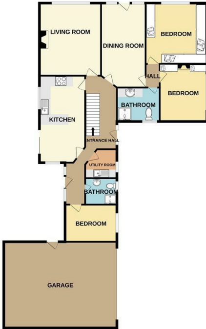
GROUND FLOOR 1629 sq.ft. (159.9 sq.m.) approx.