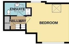
1ST FLOOR 320 sq.ft. (29.7 sq.m.) approx.