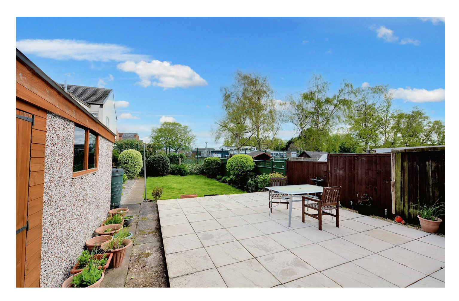
A WELL PRESENTED, TWO BEDROOM SEMI-DETACHED BUNGALOW WITH OFF STREET PARKING, GARAGE AND ENCLOSED REAR GARDEN, BEING SOLD WITH NO ONWARD CHAIN.

Robert Ellis are delighted to bring to the market this well presented, two bedroom semi-detached bungalow. The property is constructed of brick and benefits double glazing and gas central heating throughout and would ideally suit a wide range of buyers. An internal viewing is highly recommended to appreciate the property and location on offer.