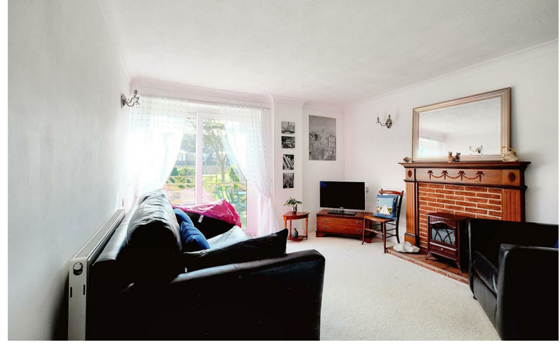
Maple Cottages Risley, Derbyshire DE72 3WJ