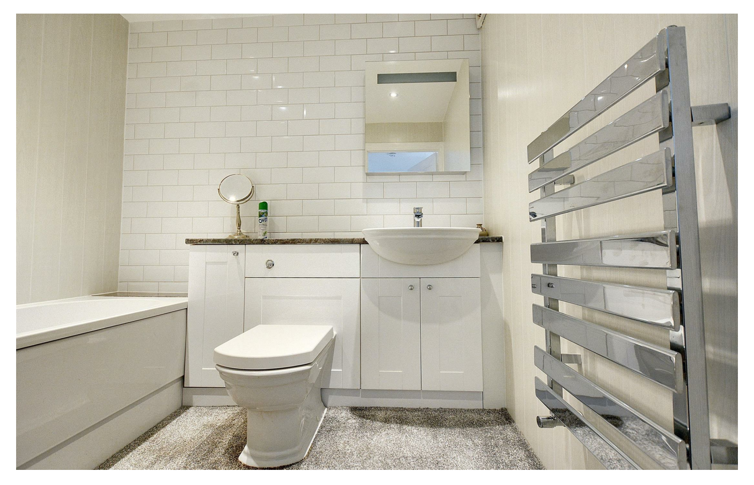
ROBERT ELLIS ARE DELIGHTED TO BRING TO THE MARKET THIS TWO BEDROOM COTTAGE-STYLE GROUND FLOOR BUNGALOW EFFECT MAISONETTE SITUATED IN THE HISTORICAL GROUNDS OF RISLEY HALL.

With single level accommodation comprising a spacious entrance hallway with useful storage cupboards, modern fitted kitchen, spacious lounge/dining room, two bedrooms and a modern three piece bathroom suite.