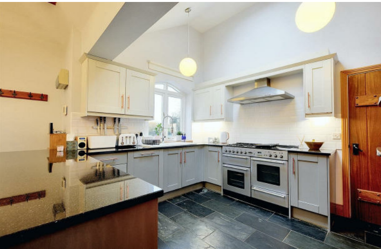
3 Hill Farm Court, Common Lane, Bramcote, Nottingham NG9 3NT