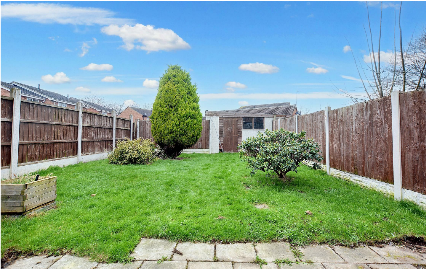
A TWO BEDROOM SEMI-DETACHED CORNER PLOT PROPERTY WITH GARAGE AND OFF STREET PARKING, BEING SOLD WITH NO ONWARD CHAIN.

Robert Ellis are delighted to welcome to the market this spacious and well presented, two bedroom semi-detached home offering off street parking, a garage and a spacious corner plot with the added benefit of being sold vacant, no onward chain. The property would be suitable for a wide range of buyers including first time buyers, investors looking for buy to let properties and equally people who are looking to downsize. An internal viewing is highly recommended to appreciate the property and location on offer.