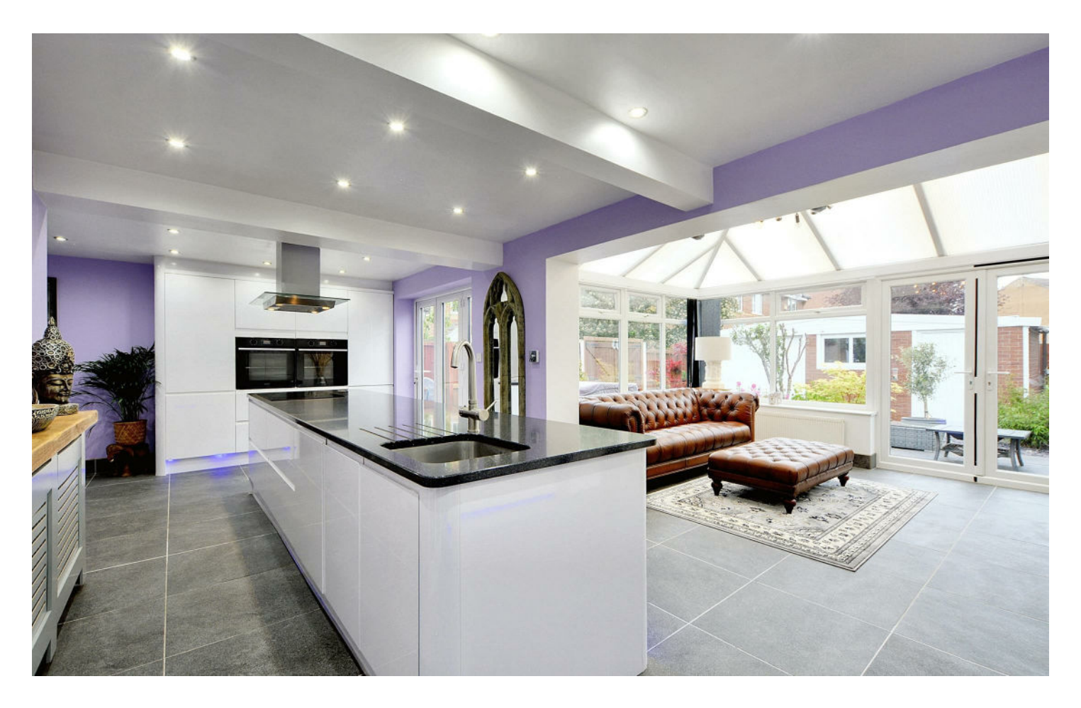
A WELL PRESENTED, EXTENDED THREE BEDROOM SEMI-DETACHED HOUSE WITH OFF STREET PARKING, ENCLOSED GARDEN AND GARAGE.

Robert Ellis are delighted to bring to the market this extended and well presented three bedroom semi-detached house with off street parking and enclosed rear garden perfect for a wide range of buyers. The property is constructed of brick and benefits double glazing and gas central heating throughout and an internal viewing is highly recommended to appreciate the property and location on offer.