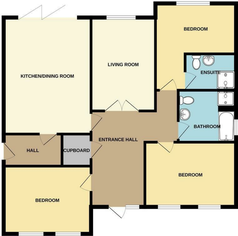
TOTAL FLOOR AREA: 1014 sq.ft. (94.2 sq.m.) approx. Whilst every attempt has been made to ensure the accuracy of the floorplan contained here, measurements of doors, windows, rooms and any other items are approximate and no responsibility is taken for any error, omission or mis-statement. This plan is for illustrative purposes only and should be used as such by any prospective purchaser. The services, systems and appliances shown have not been tested and no guarantee as to their operability or efficiency can be given. Made with Metropix ©2024